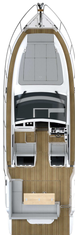
MAIN DECK Option with barbecue at stern, long platform and fixed cockpit table