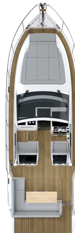
MAIN DECK Option with cockpit table to be transformed into sunpad and extended bathing platform