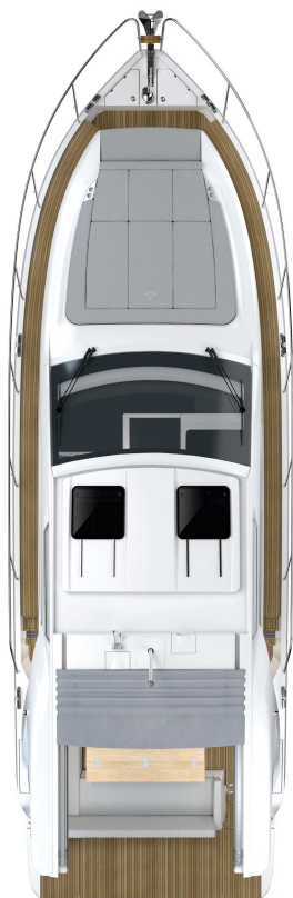
MAIN DECK Standard