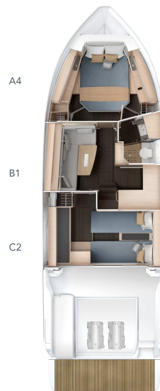
LOWER DECK Option storage room with cupboards