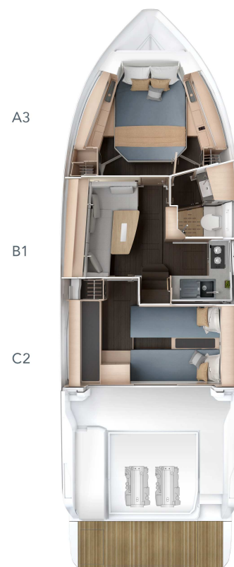
LOWER DECK Option galley with electric cooking top and microwave