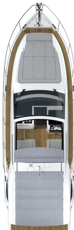
MAIN DECK Option with soft-top