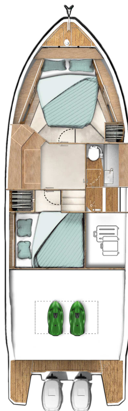
LOWER DECK standard