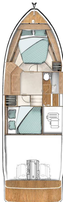
LOWER DECK standard