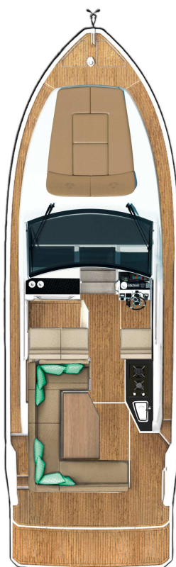
MAIN DECK with extended bathing platform