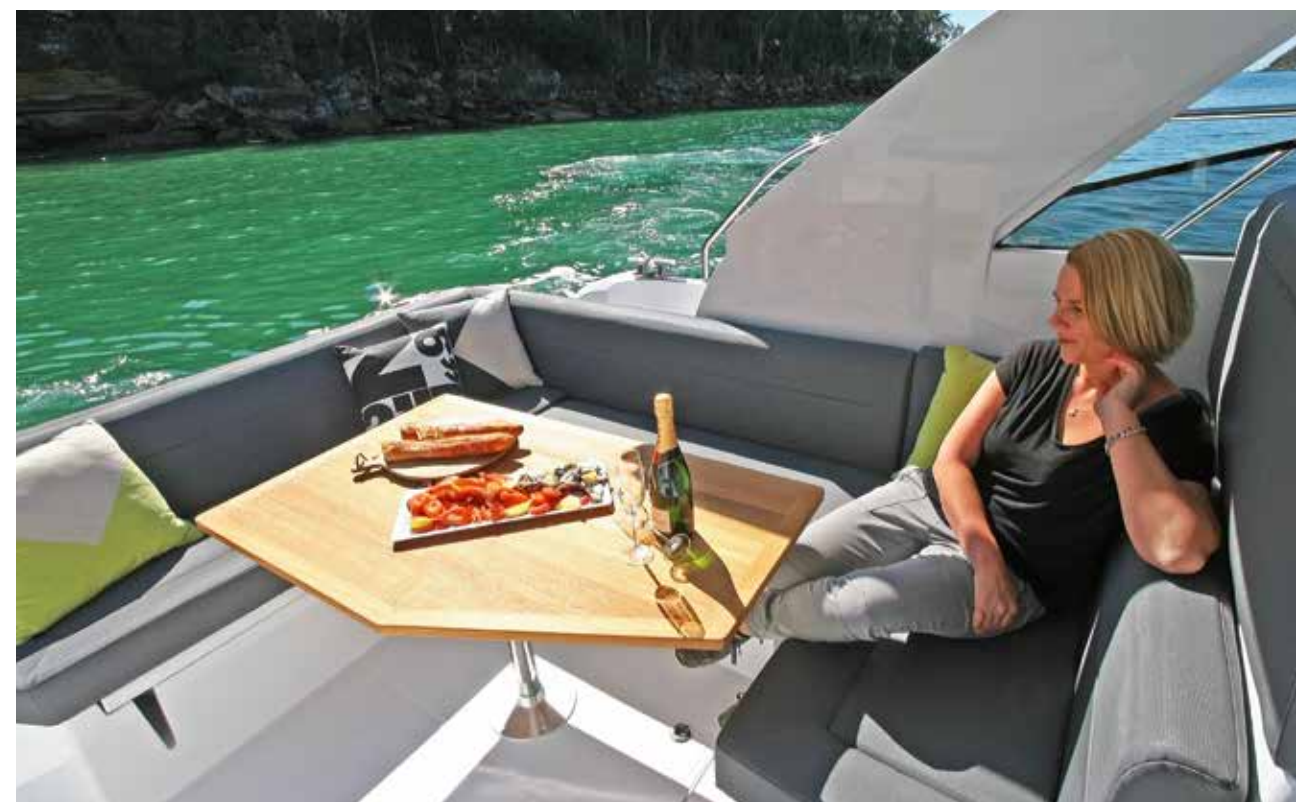
Below: Semi-enclosed cockpit layout provides shelter when needed.

timber cabin panelling. Our test boat had Florentine oak surfaces that are very pleasing to the eye and no doubt easy to clean. Unlike earlier-generation European boats, the Sealine S330 feels right at home in our warm, sunlit Aussie environment.