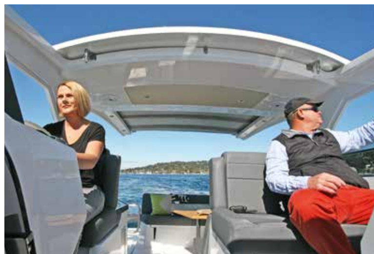
Above and below: The open sunroof transforms the interior.

The square-cut bow is just one manifestation of an exciting, fresh design approach. It's a practical craft, too, with the longer waterline making for a bigger, more spacious hull while contributing to better wave-cutting action and fuel economy.