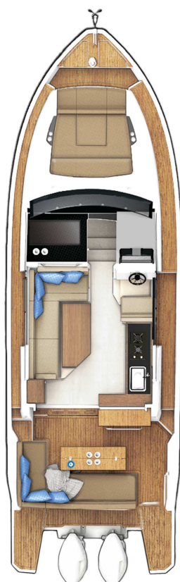
MAIN DECK optional with fixed cockpit table and extended bathing platform