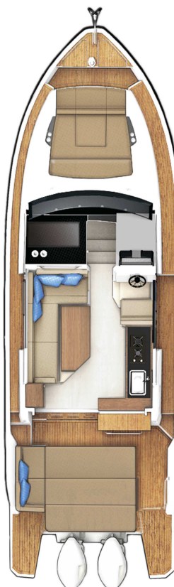
MAIN DECK optional with cockpit table to be transformed into sunpad and extended bathing platform