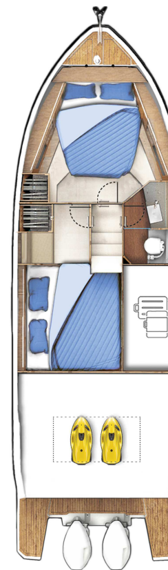
LOWER DECK optional