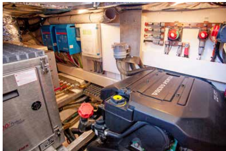
Below: The DS54’s deck saloon design frees up space in the hull, including in the engine room.

In no time, the DS54 settled into a steady rhythm as we rode over the long swell off Barrenjoey Headland, with sheets just eased. This yacht is no lightweight, but the helm felt firm and responsive as we built to 8.5 knots of boat speed in 14 knots of breeze, a speed that could rise to an impressive 12 knots at a 140-degree true wind angle in 25 knots of breeze with the spinnaker set, according to the design velocity prediction diagrams.