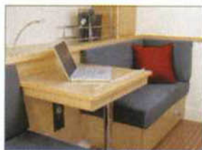
The saloon sitting area can be configured in several ways, including with this small table

The Hanse 430 has a distinctly modern interior, especially with the optional cherry finish. The standard mahogany interior with white bulkheads does give a nod to the past, but nobody will mistake the accommodation space for a Herreshoff design. Cabinetry is flush-surfaced and precisely fitted, and the grabrails outboard of the seats blend so neatly into the decor that the skipper may need to point them out to guests. While this boat is unquestionably strong and seaworthy enough to cross oceans, the interior makes it clear that its main mission is stylish cruising. Note that voyaging will call for leechcloths on the bunks, higher countertop fiddles, and positive latches on the cabin sole. Hanse lets buyers choose among berth configurations (standard V-berth or offset Pullman berth, with or without a pilotberth) for both the forward and aft cabins; another choice is between one or two cabins aft.