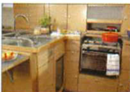
The galley layout, like the rest of the boat, is both stylish and functional