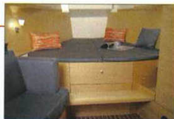
The forward cabin with ensuite head is worthy of being called the "owner's cabin"