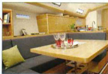
The elegantly modern saloon styling makes it a pleasant space to hang out