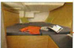
Dual aft cabins with large double berths are the most common guest-cabin layout