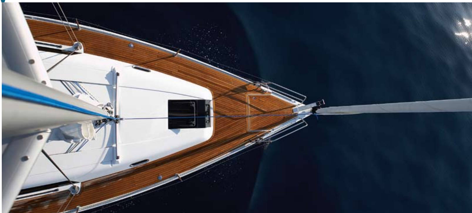
Design judel / vrolijk & co