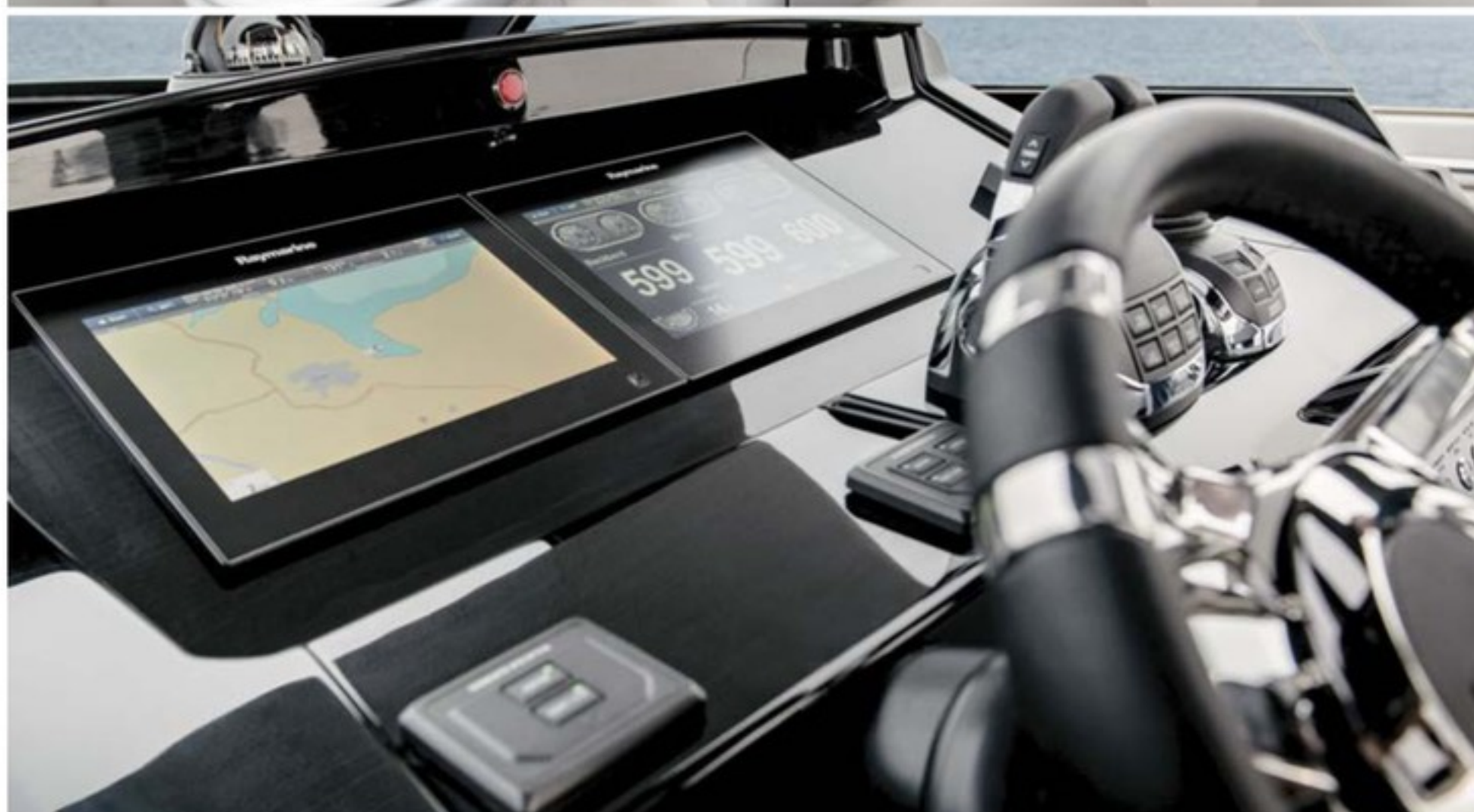
Simplicity and minimalistic design reigns throughout the 48 Open, from the guest cabin, through the en-suite and even at the helm.