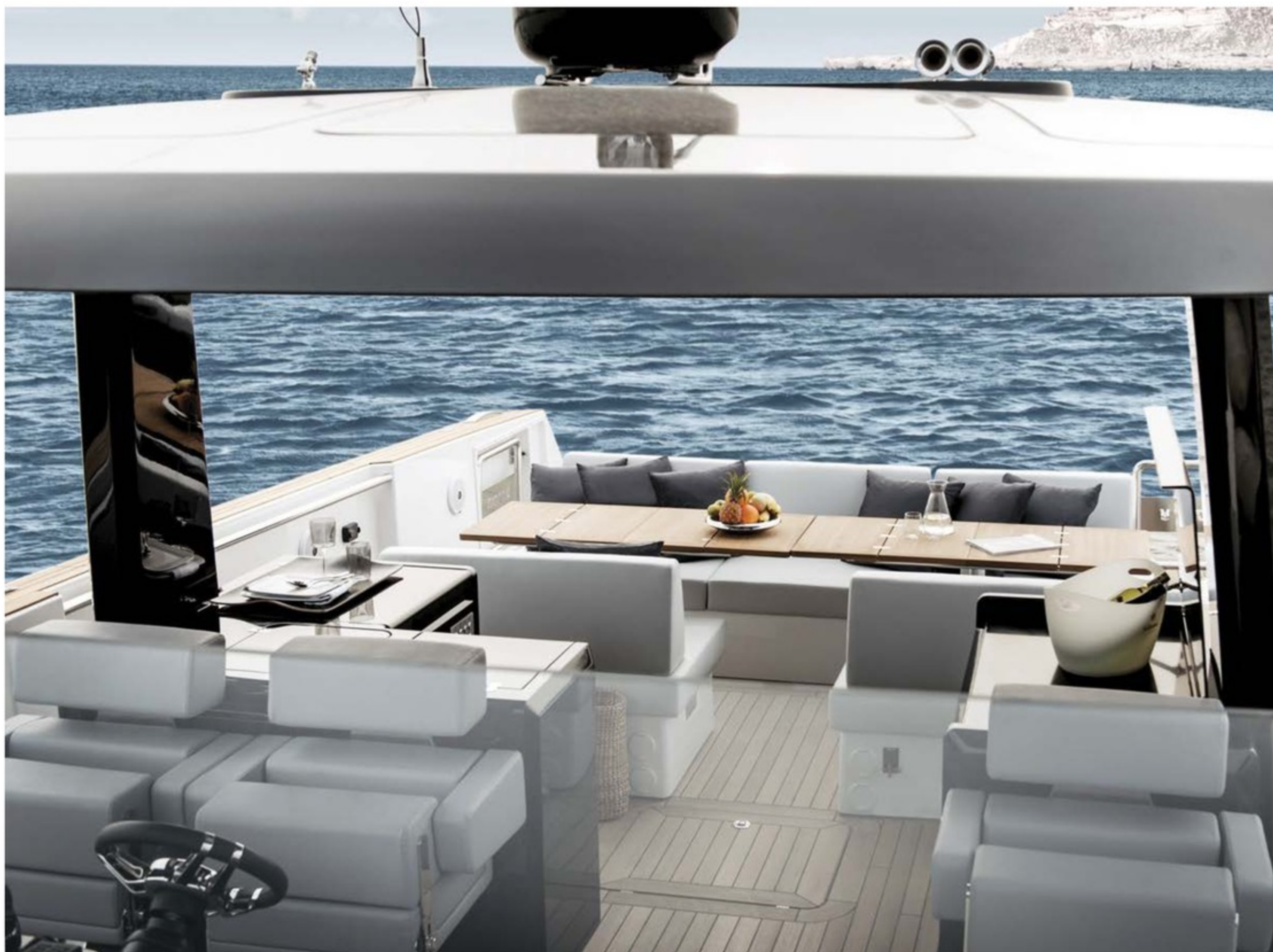
Concealed within the cockpit's apparent simplicity is a considerable amount of artfully conceived versatility.