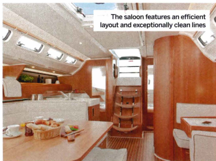
The saloon features an efficient layout and exceptionally clean lines

The fractional rig features a tapered, keel-stepped Seldén aluminium mast with double sweptback spreaders. Total working sail area is 1,228ft 2 , spread between a 106-percent genoa and a traditional mainsail. Full battens on the main and a hydraulic backstay allow you to tweak the sail shape to maximize speed. A self-tacking jib is also available, as is a competition rig that