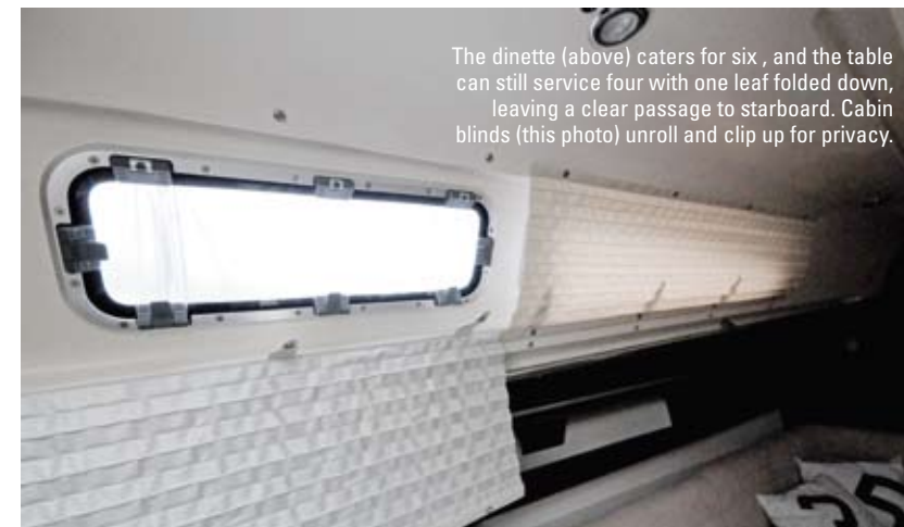
The dinette (above) caters for six, and the table can still service four with one leaf folded down, leaving a clear passage to starboard. Cabin blinds (this photo) unroll and clip up for privacy.

The rack-and-pinion helm works like a 'circular tiller', having no lost motion in its action and spurring instant reaction from the huge rudder. Wheel diameter is sufficient for a hiking helmsperson to retain perfect control and well-positioned foot braces are fitted.