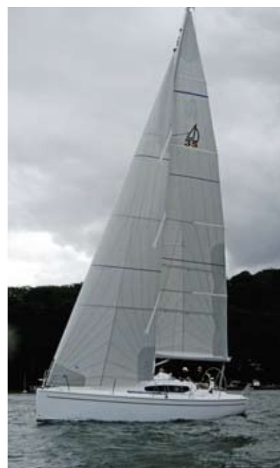
Cockpit design (top) focuses on ease of crew movement and line handling. The Dehler 35 (above) promises competitive racing and cruising fun, too. Instruments (opposite) are located above the companionway so everyone can see them.

L ike many yachtmakers Dehler was hammered by the Global Financial Crisis and the situation was compounded by the fact that the company had only just taken over Etap Yachts. After a late-2008 bailout by the German Government failed to stave off the inevitable, Dehler was acquired by the Hanse Group in 2009 and therefore should have a bright future. (Etap Yachts – physically unsinkable if not financially so — was taken over by the Belgian MIC Group and may surface once more).