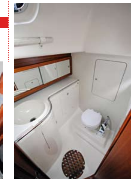
The moulded head/shower (above), with traditional teak grate, is roomy. Unlike other yachts, the companionway and heavily insulated engine cover (left) lift off for maintenance.

The Dehler 35 is a strongly made performance cruiser/racer that can be specified to suit individual owners' requirements. She performs well in standard trim, but can be optioned to a higher level than many of its competitors. Fit and finish is legendary, yet the price is right. And with great local backing under the Team Windcraft banner, this well-respected brand should enjoy a new lease on life in Australia.