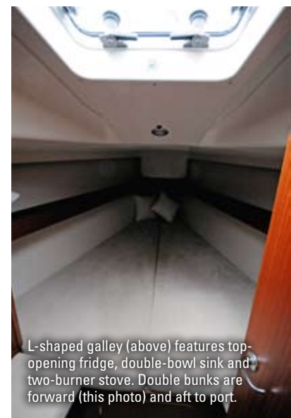
L-shaped galley (above) features top-opening fridge, double-bowl sink and two-burner stove. Double bunks are forward (this photo) and aft to port.

The Dehler 35 is built from handlaid balsa-cored deck and hull mouldings that are laminated